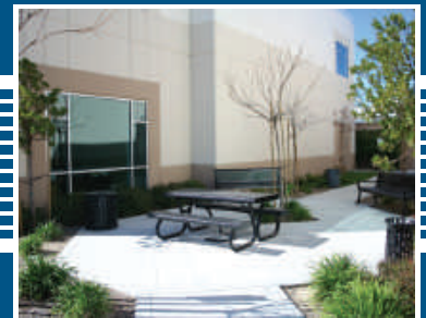
Common outside dining & rest area