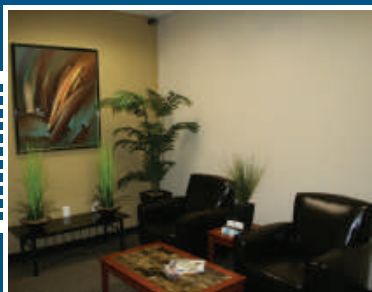
Common rest & work area upstairs