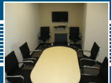
Brand new, modern conference room