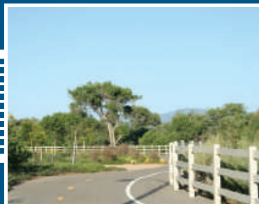
One of many picturesque paseos across the street