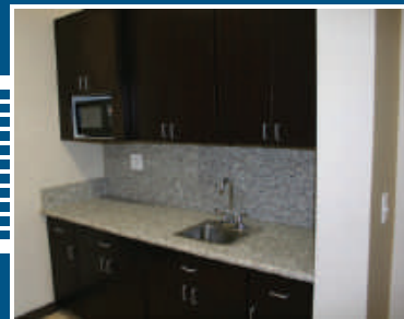
Common granite kitchenette